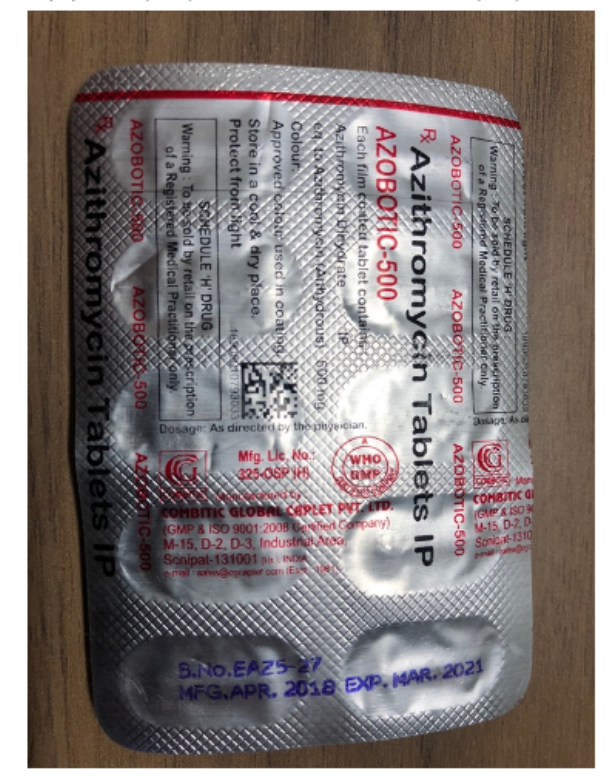
(B) WHO GMP logo on the package

(A) Sample product differences from purported same manufacturer (amoxycillin and potassium)